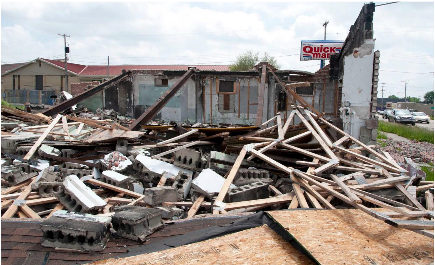
Destruction from a May 2013 Tornado in Genesee County

Tornadoes generally travel from the southwest at an average speed of 30 mph. However, some tornadoes have very erratic paths, with speeds approaching 70 mph.