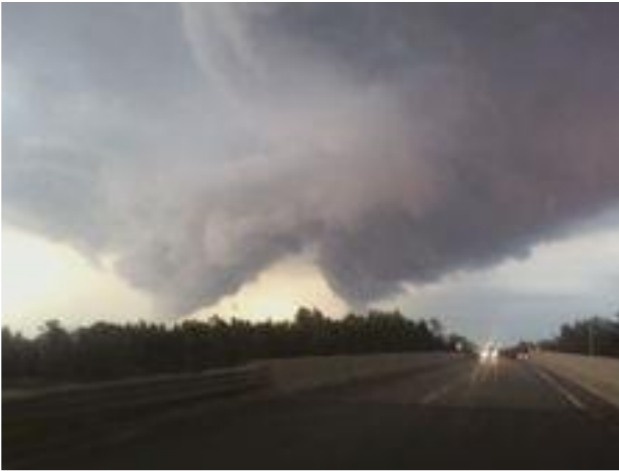
Tornado in Grayling area.