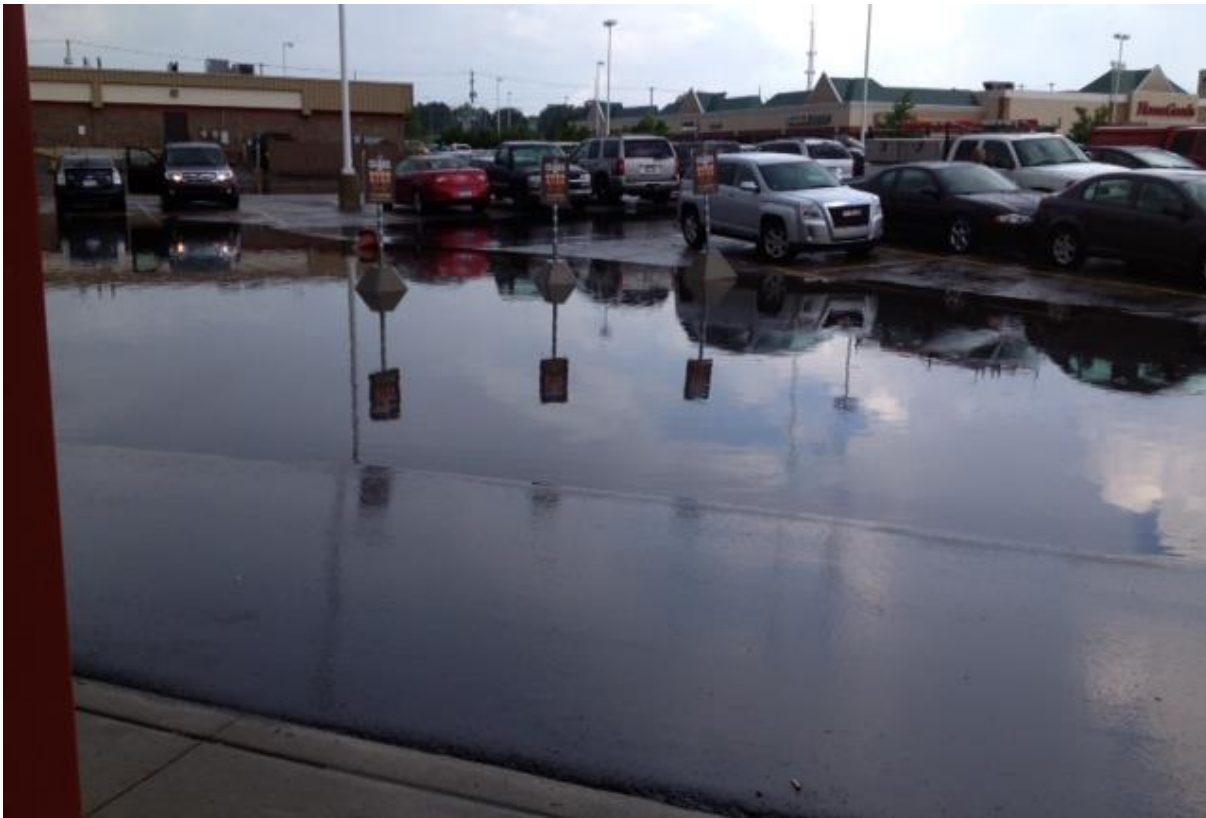
Flooding, Lansing, 2018

To help calculate flood damage that could occur to your home, visit www.floodsmart.gov and click on the link to learn more about "What Could Flooding Cost Me?"