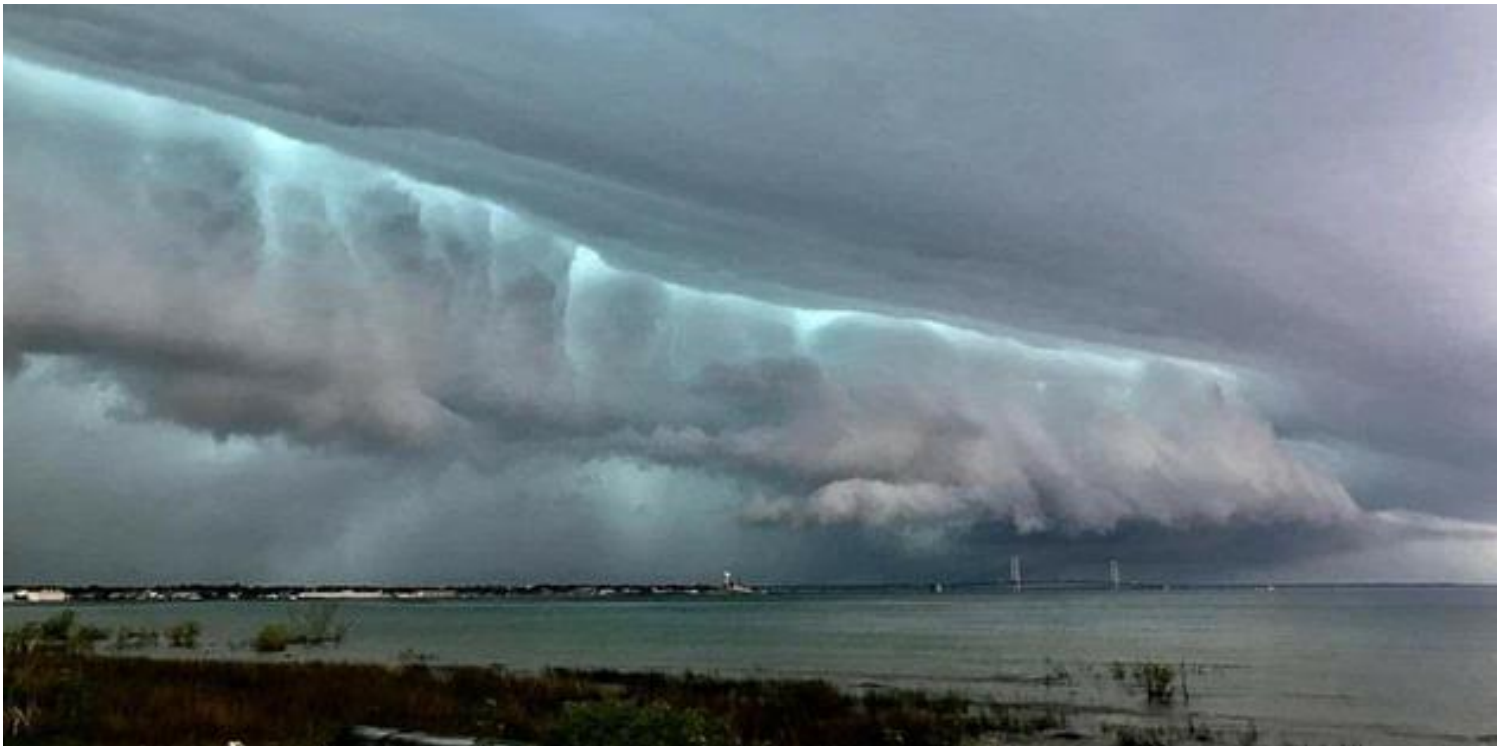
June 11, 2017 severe weather approaching the Mackinac Bridge.

This packet was prepared by the Michigan Committee for Severe Weather Awareness (MCSWA), a coalition formed in 1991 to promote safety awareness and coordinate public information efforts regarding tornadoes, flooding, lightning and winter weather.