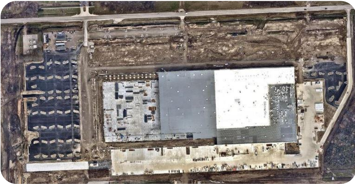
Amazon Distribution Center, Romulus MI - Under Construction Nov 2017