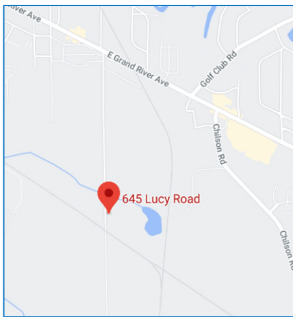
Figure 1. Location of proposed scrap metal shredder

Padnos is proposing to install a new scrap metal shredder at 645 Lucy Road in Howell, Michigan (Figure 1). The shredder will process cars, appliances, and other metal-containing materials. The scrap metal shredder and associated equipment will break down and separate waste material from the product (recycled metals). Material not able to be recycled would be sent to a landfill. The proposed equipment has air emissions which require an air permit.