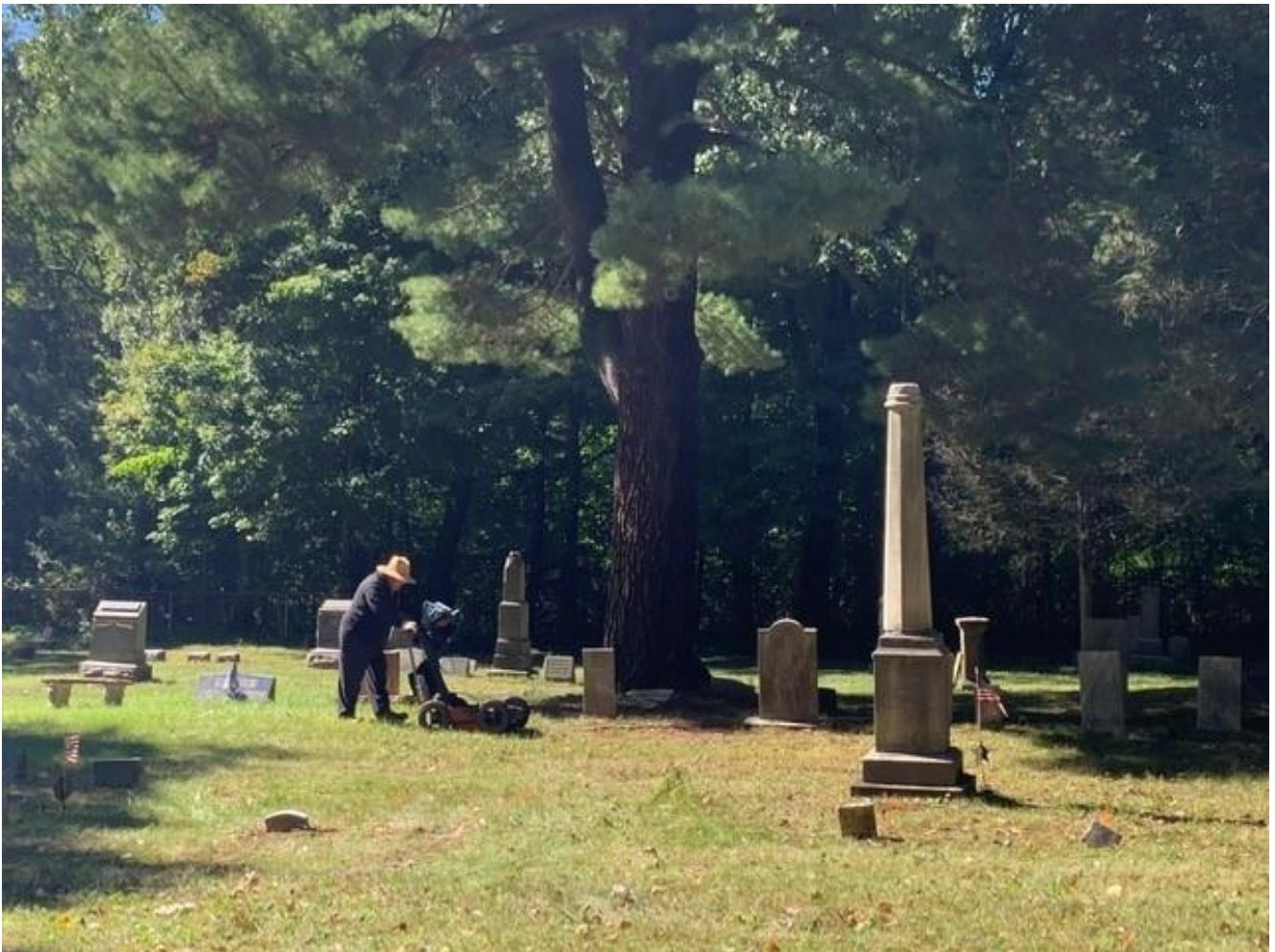
Geologist Matt Turner of GeoModel, Inc. scans Green Oak Plains Cemetery on Maltby Rd. September 24, 2021

DETAILED REPORT AND FINDINGS OCTOBER 2021