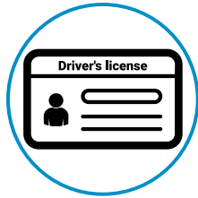
Nicotine Compliance Checks