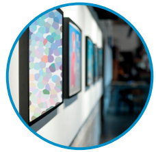
Youth Art Voice