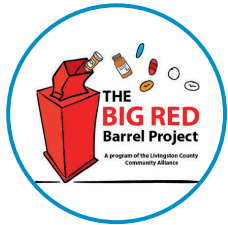
Big Red Barrel