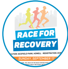
Race for Recovery